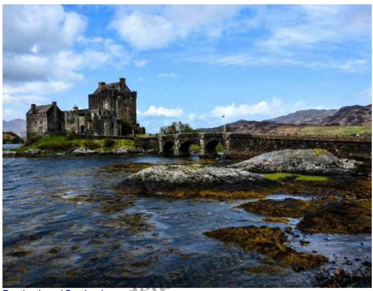
Destinations / Scotland