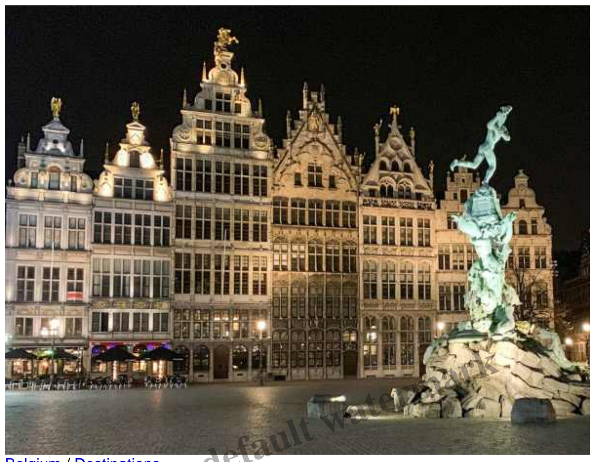
Belgium / Destinations