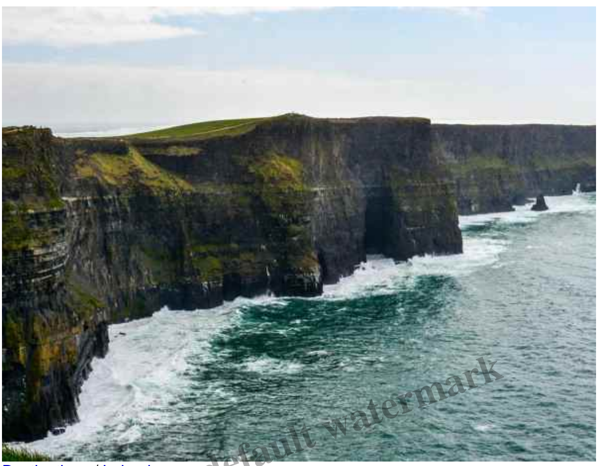
Destinations / Ireland