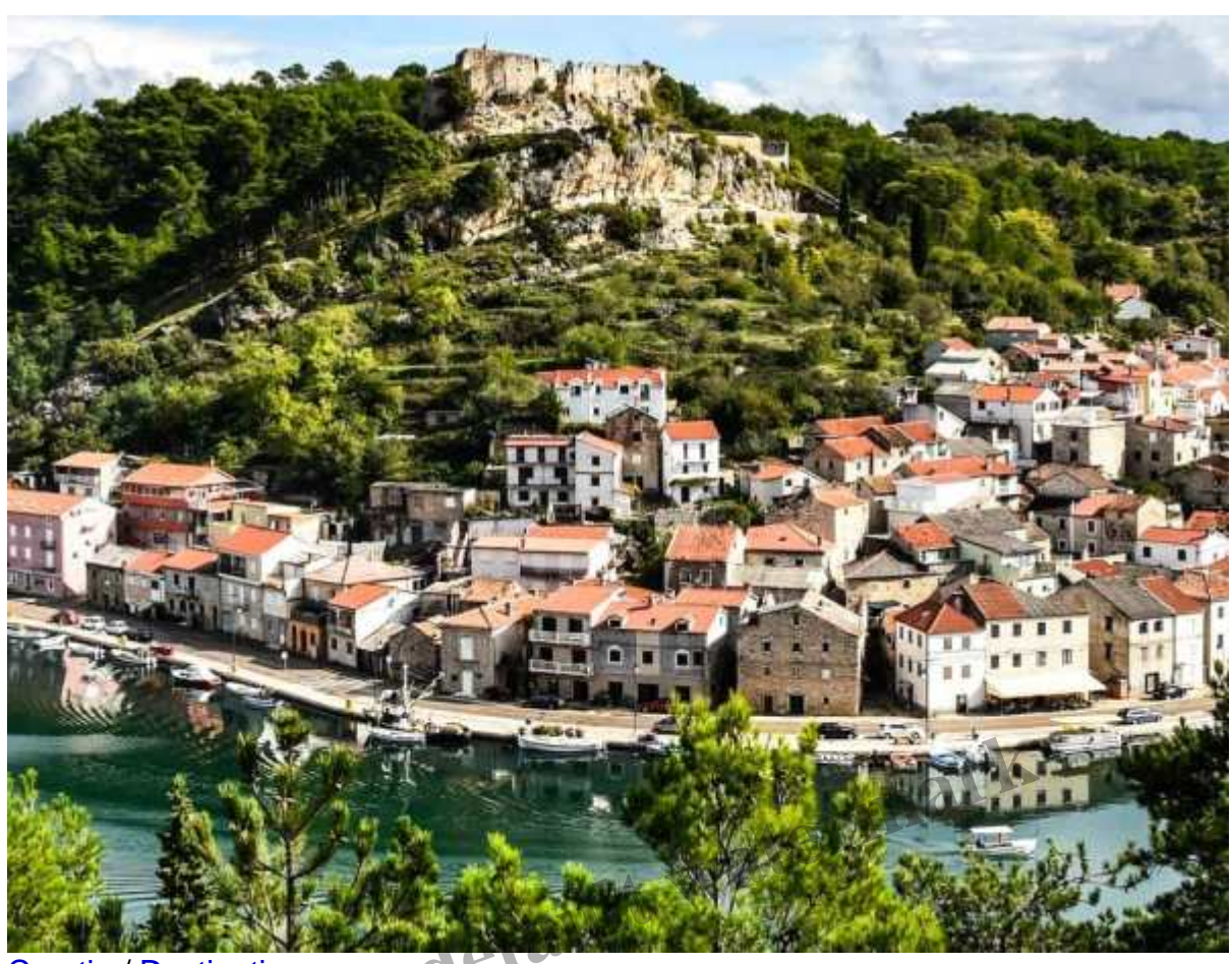
Croatia / Destinations