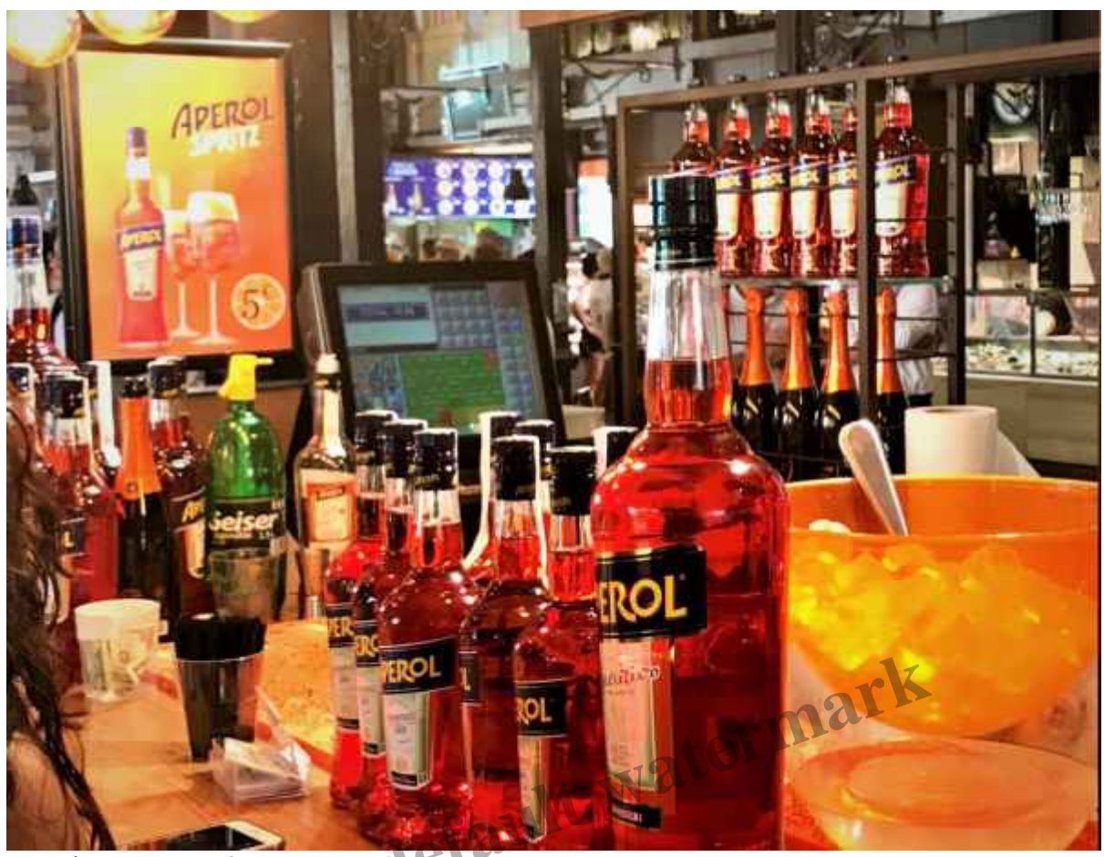
Italy / Libations of the World