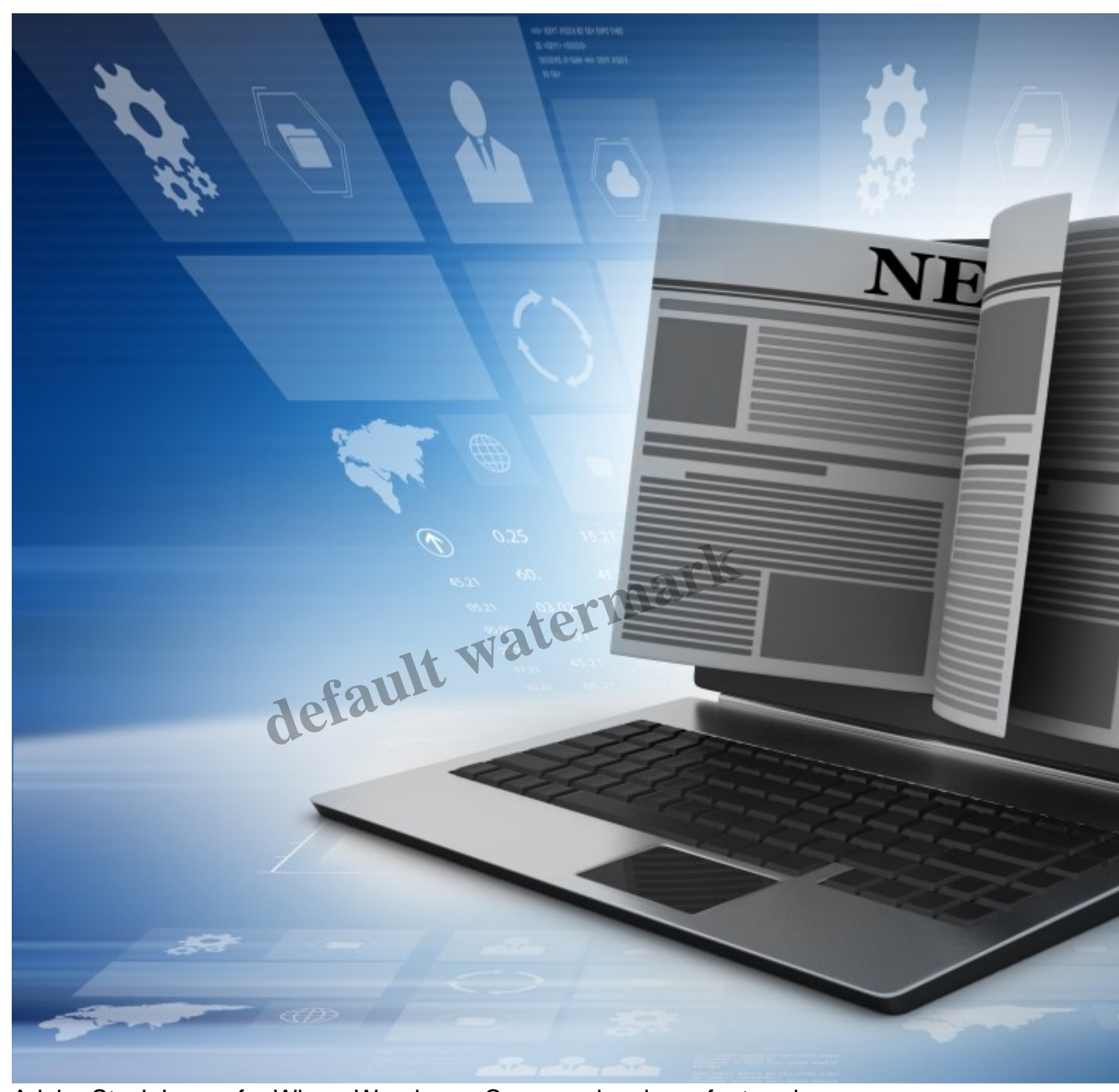
Adobe Stock Image for Where Wanderers Compass has been featured