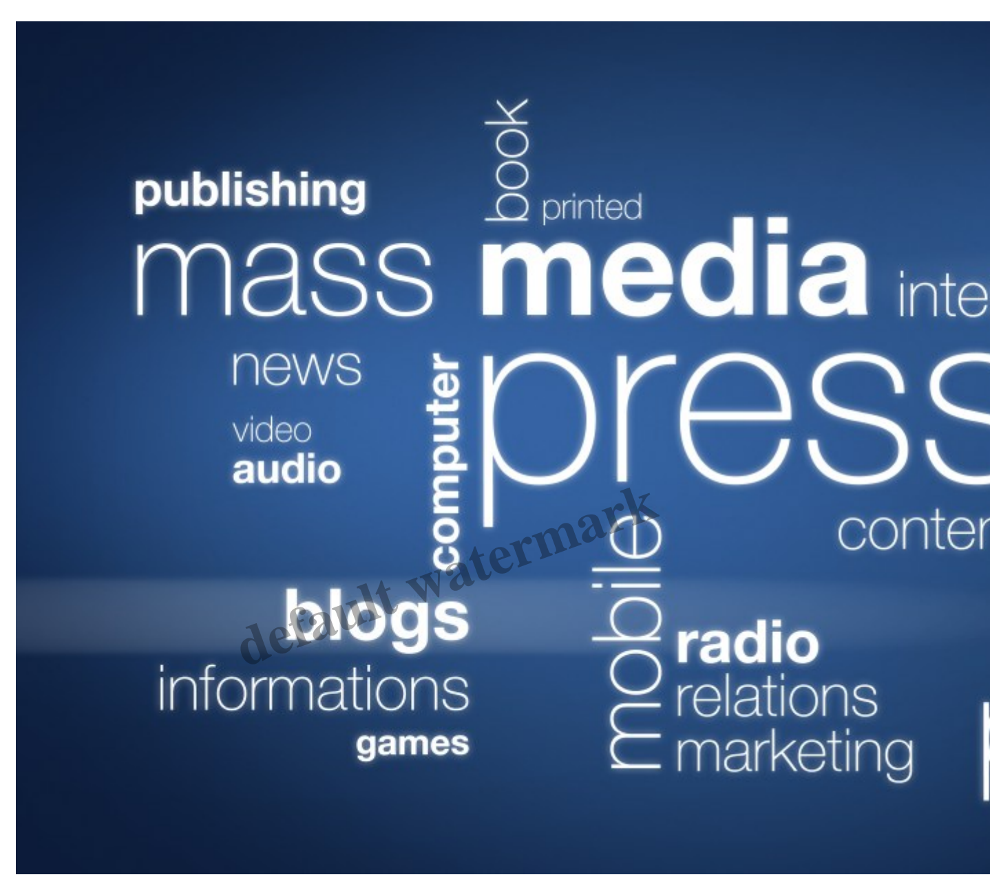
Adobe Stock Image for Where Wanderers Compass has been featured

Below is a list of all the publications and television media appearances in which Wanderers Compass has been featured.