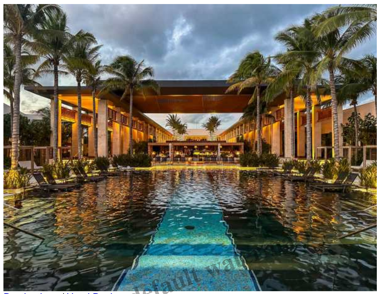
Destinations / Hotel Reviews