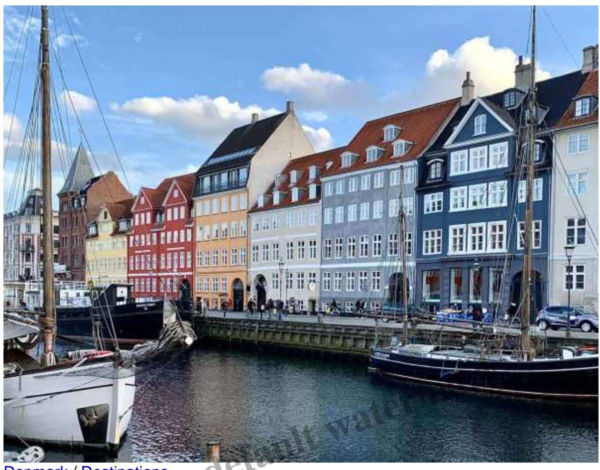
Denmark / Destinations