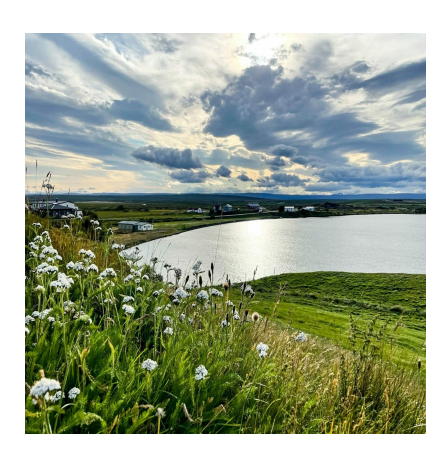
Wanderers Compass Videos