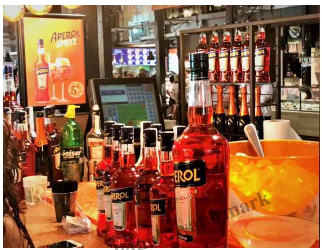
Italy / Libations of the World