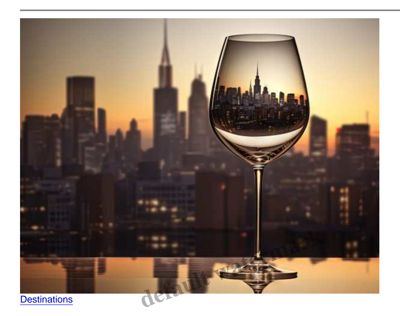
Top 6 Restaurants in Singapore to Impress Your Partner