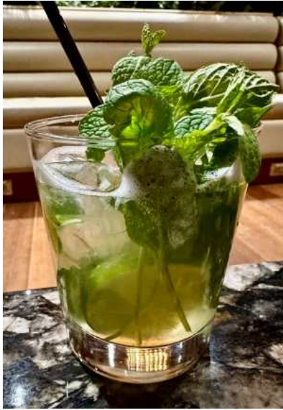
Travel Like a Pro

flight to lounge hop. Check out our page, Best Credit Cards for Travel .