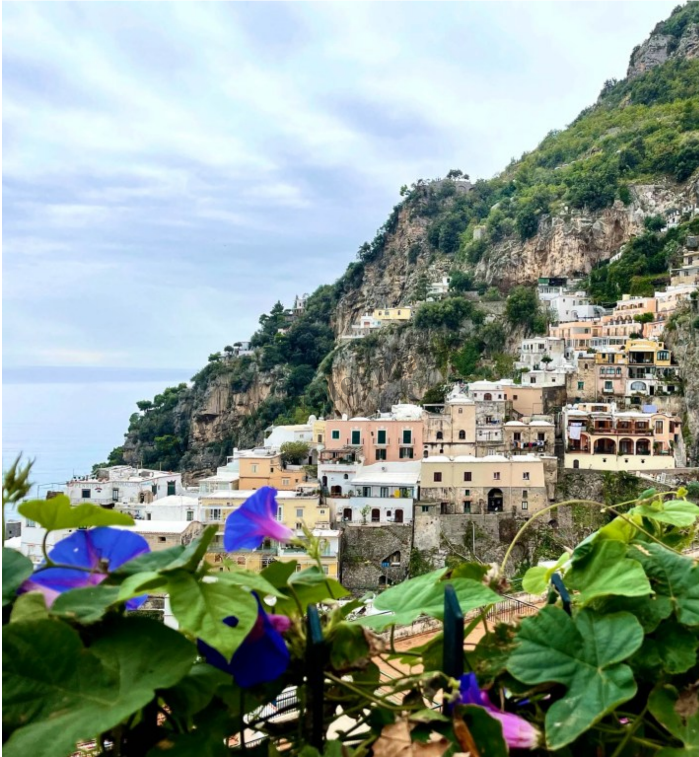
Travel Like a Pro Positano, Amalfi Coast, Italy