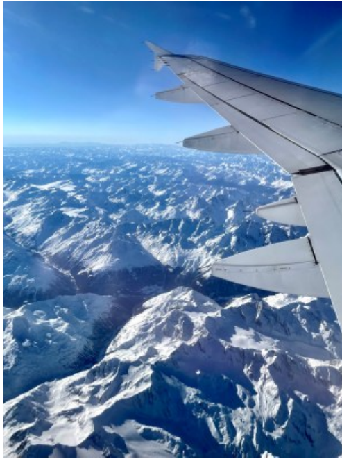
Travel Like A Pro

Too often, I hear I wish I could travel like you do, but I can't handle how stressful it is to fly. They asked me why I was not stressed out. Thirty years ago, I would have been. I dreaded my travel days, entering them anxious and distressed. Multiple factors played a role. I hated the long lines at the airport, sitting around waiting to board, worried about making the flight, fearful about how my long legs would handle the squeezed space, the tedious wait for luggage, and, of course, to add to it all, my fear of flying. Yes, over 1,500,000 flight miles later, I am still a nervous flier.