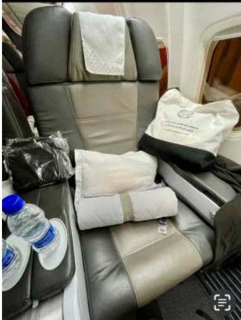
Travel Like a Pro United Business Class

Keeping within a reasonable budget is essential to travel as much as we do. We pay our way or use our points for travel. We work hard to keep our costs down. When traveling, anything that can make the experience more fun and relaxed is invaluable. When, in the end, it saves us money, it is a huge bonus.