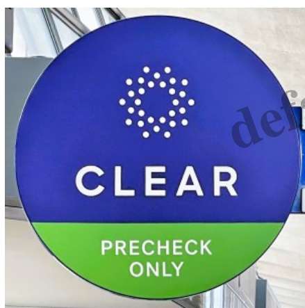
Travel Like a Pro

4. TSA Precheck and CLEAR through security in less than 3 minutes. There is no need to remove shoes, laptops, or separate liquids. I have never waited for more than 10 minutes in this line, and it is usually less than 5 minutes. There is an application process, and each is a separate option. We got our TSA Precheck via Global Entry . CLEAR is an added option to expedite the process even more. All three can be free if you have a credit card geared toward travel.