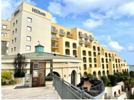
Travel like a Pro Hilton Malta

13. I am loyal to Hilton properties. As a result of my elite status, I received a nice room upgrade for free and a daily beverage and food allowance of $16 each for two people to use at my discretion. In Europe, they offer a full breakfast for two at no cost. Certain credit cards, including some Hilton brand cards, provide free status with no minimum yearly stays.