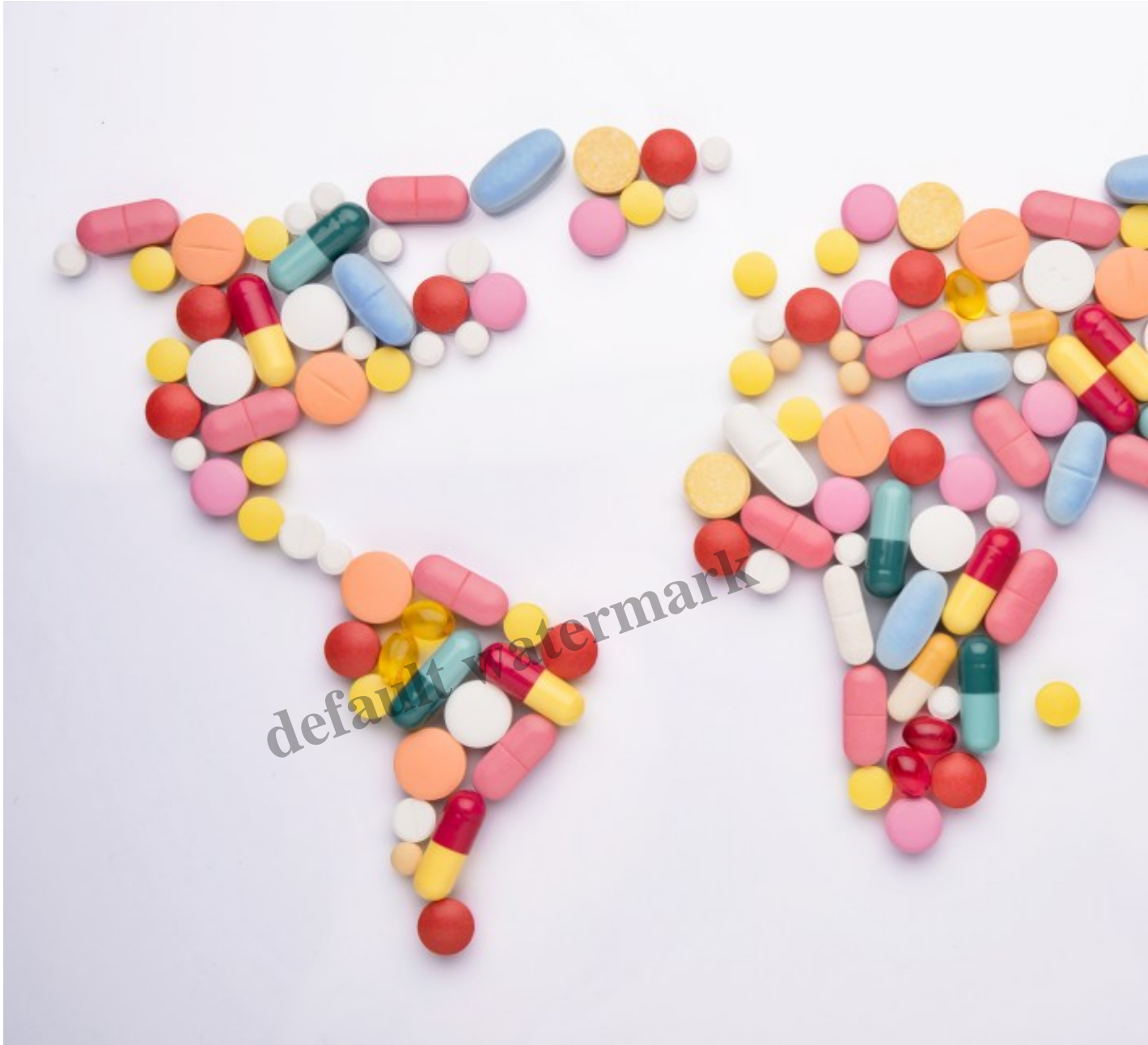
World map medicine

If you embark on a dream trip, this travel tip on what essential medications for long flights will serve you well. It will help ensure your journey starts on the right foot. It takes little room, and it prepares you for any likely scenarios that will occur. Traveling feeds the soul while seeing the wonders this beautiful world offers. Being comfortable and healthy will make it even more remarkable—happy and healthy travels.