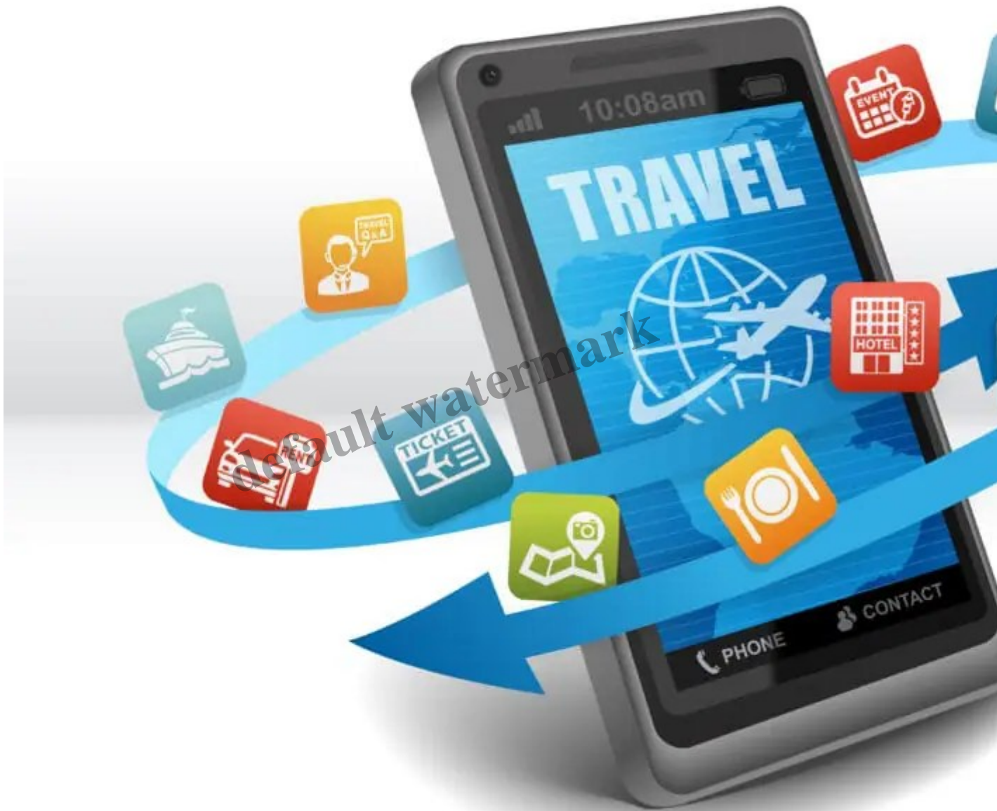
The Best Travel Apps Adobe Photo Stock