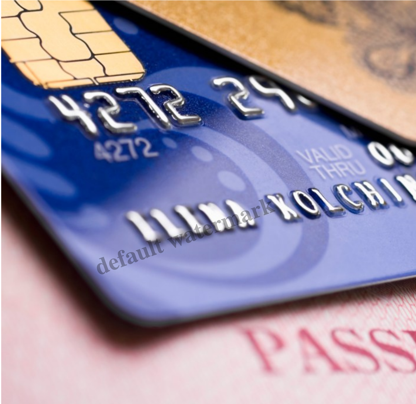
Best Credit Cards for Travel in 2024