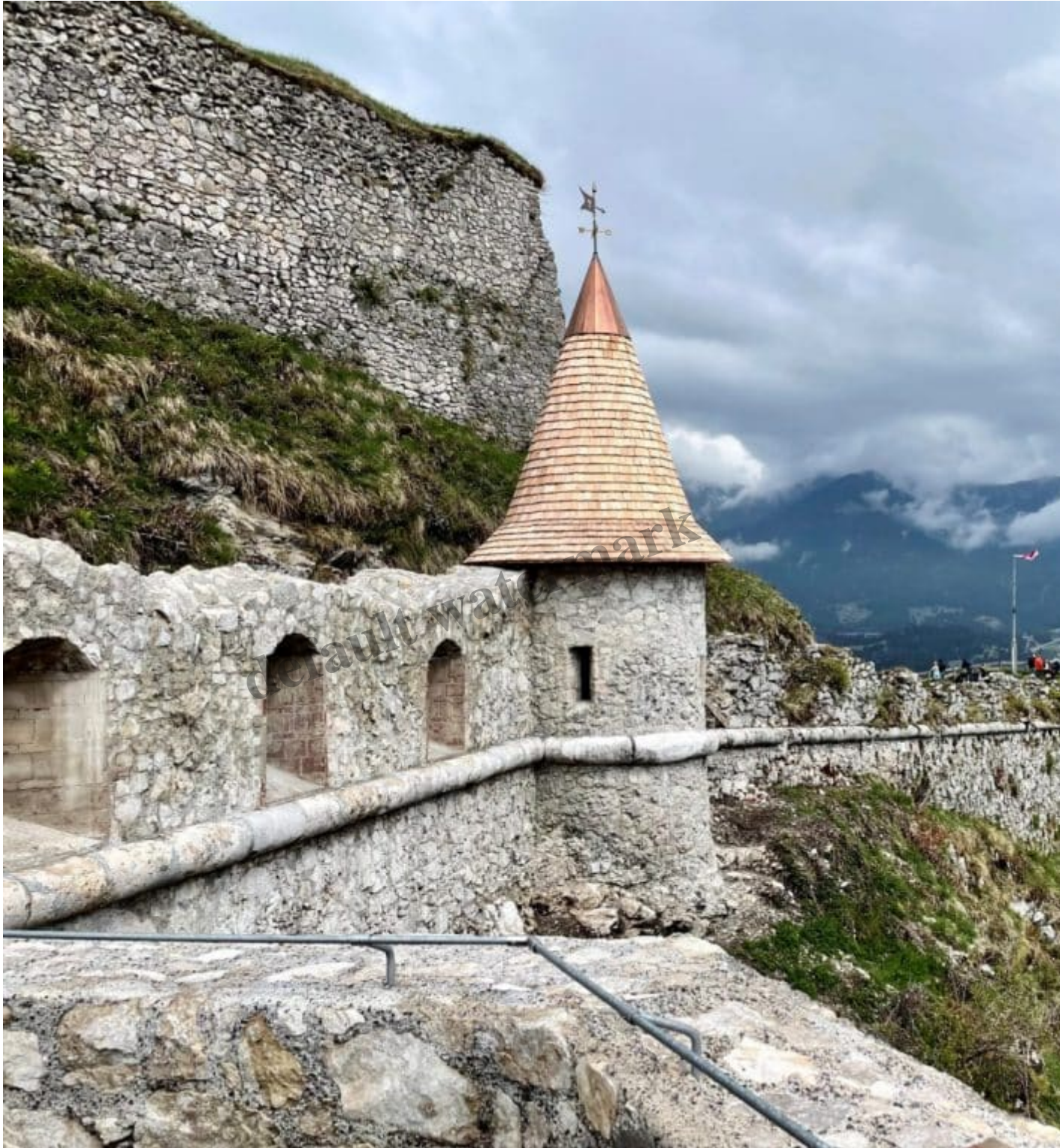
Best Credit Cards for Travel in 2024 Photo of Austrian Castle

Advertiser Disclosure: “Wanderers Compass has partnered with CardRatings for our coverage of credit card products. Some or all of the card offers on our Best Credit Cards for Travel in 2024 post are from advertisers, and compensation may impact how and where card products appear on the site. Wanderers Compass and CardRatings may receive a commission from card issuers.”