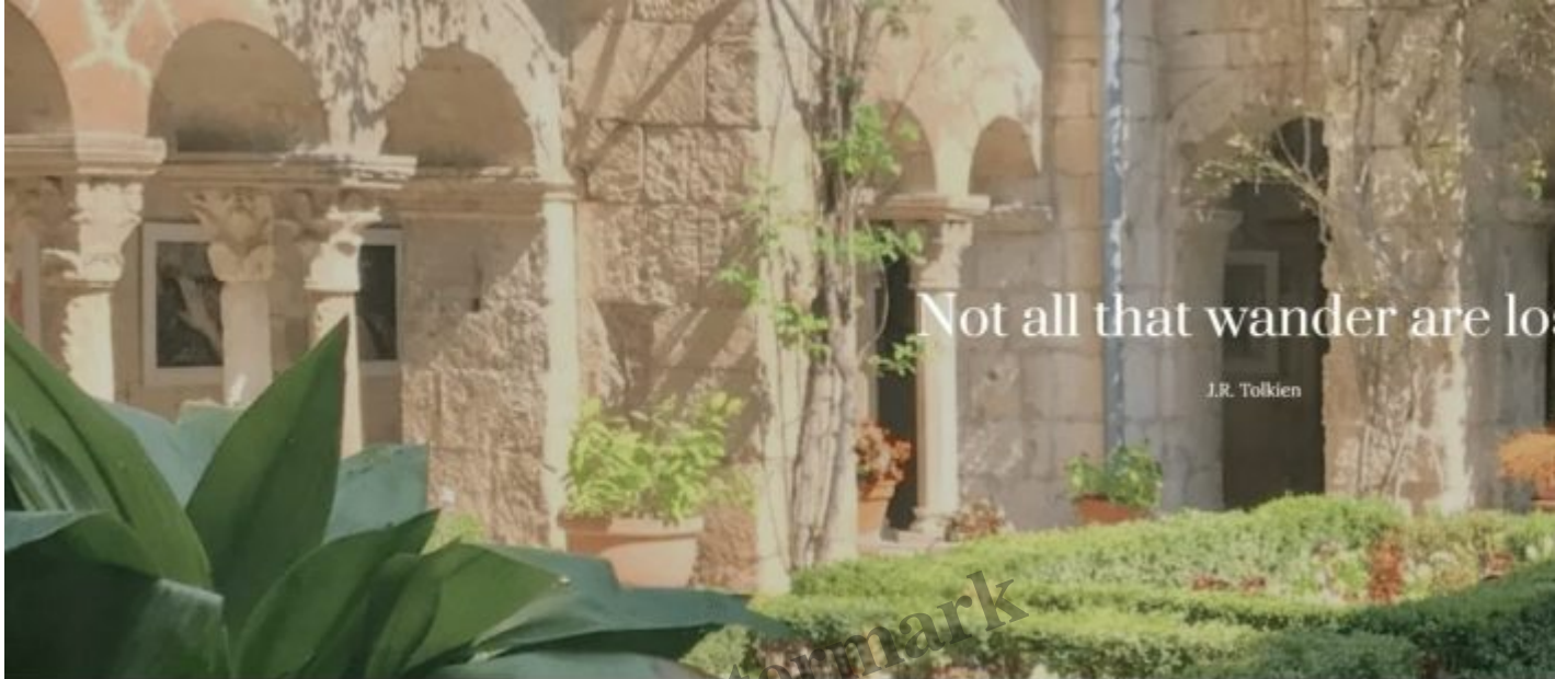
Best Credit Cards for Travel in 2024

every card on this will not fit everyone. That is because it depends on your travel style and goals. We prefer to spend reward points on hotels and flights, which is why we like the Chase Sapphire Reserve Card. We also have our travel brand travel cards (such as Hilton & United) for free companion fares, free checked luggage, room upgrades, ease of checking, elite status, and special offers.