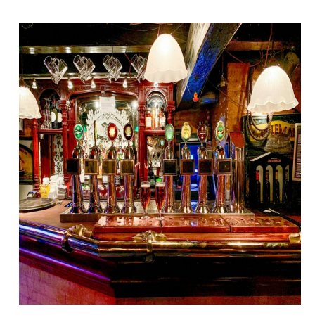
Pubs Breweries and Bars