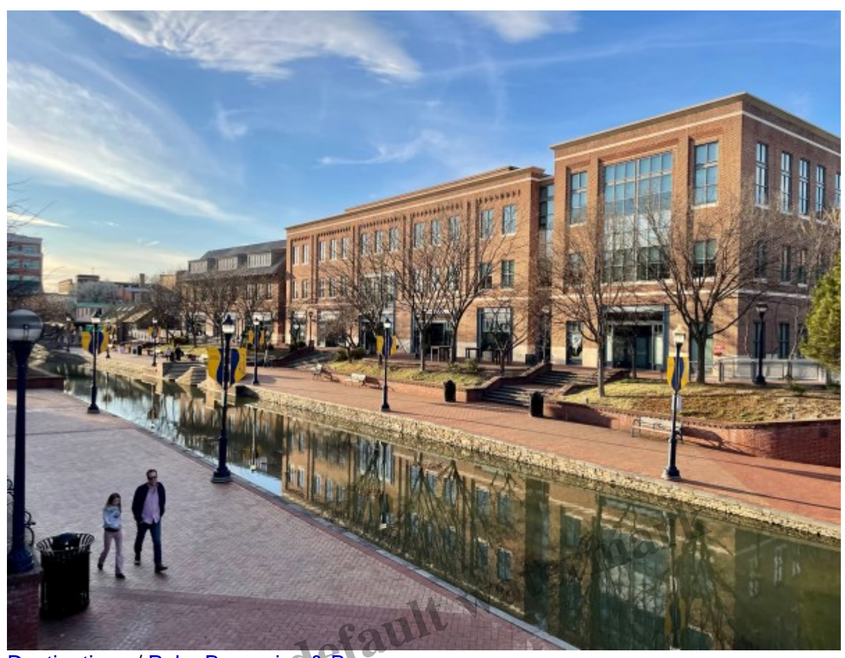
Destinations / Pubs Breweries & Bars