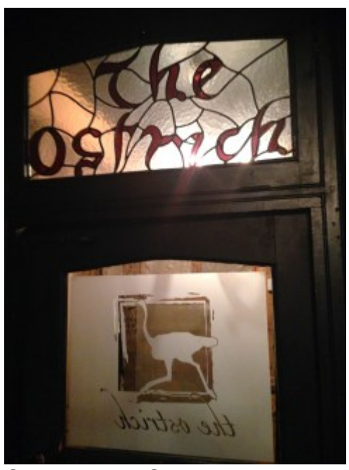
Ostrich Bar in Slough England