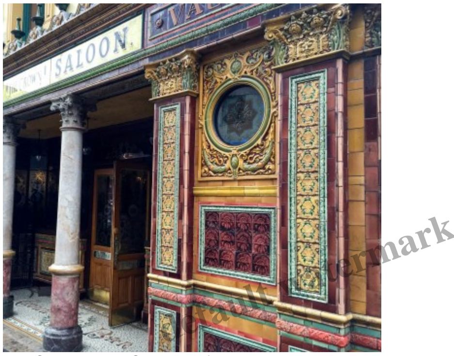
The Crown Liquor Saloon Belfast, Northern Ireland

We first became drawn to local pubs in small historical villages during a trip to Ireland. Places off the beaten path, and the simpler, the better. The atmosphere captivated us; watching the locals interact and share stories were heartwarming. If you enjoy people-watching, it is a great venue to do so. But we soon discovered how welcoming and warm they were to these strangers in their world. Maybe they don't need to know your name.