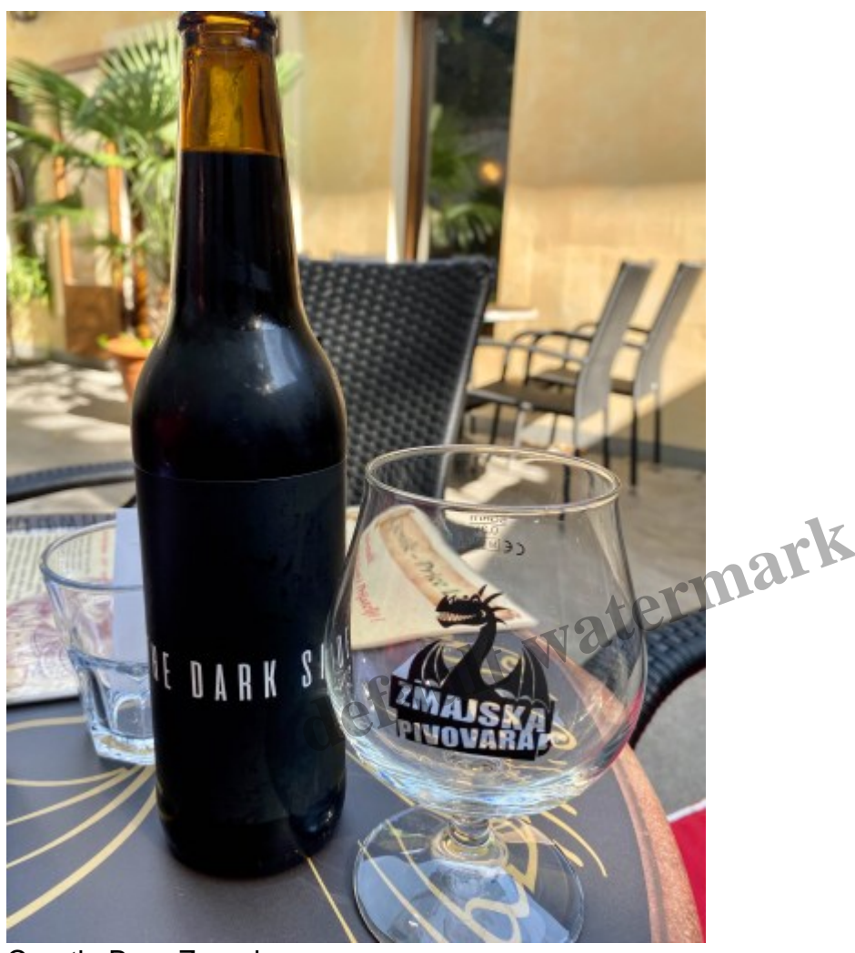
Croatia Beer Zagreb

We undoubtedly, enjoy a cold draft beer, especially of a darker variety. We make a point of asking what is local and what they recommend. We take what they suggest if they don't have a local dark brew. We tasted some fantastic beer, and then there was the Budweiser type, yuck!