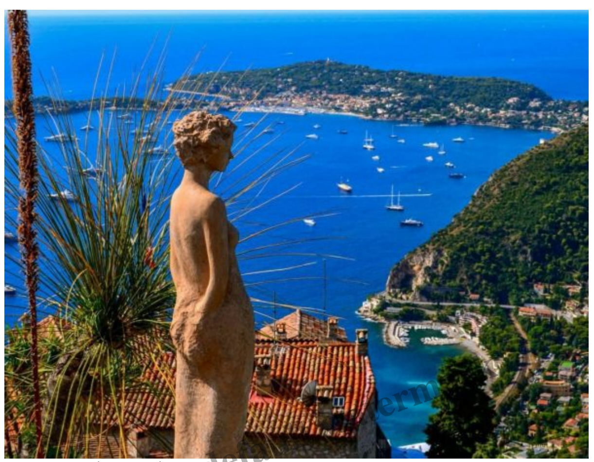
Destinations / France / Monaco