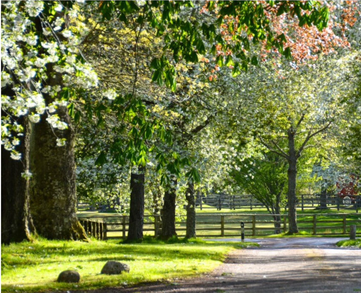
Spring in Scotland