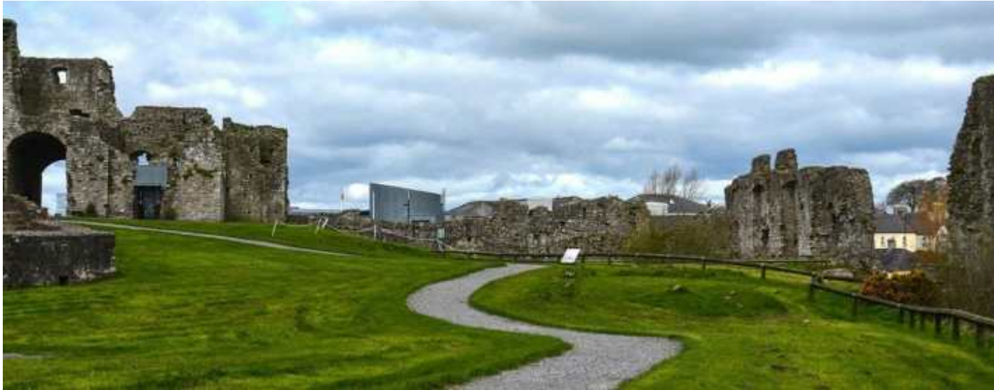
Trim Castle Ireland

Before or after the tour, take advantage of wandering the beautifully maintained site. The interior is about three acres. A path circles the grounds inside; lap around the well-kept grounds and explore the remaining southern wall. There are multiple towers within the curtain wall to enter. It provides a visual in which one can imagine how this Castle defense occurred against its enemies. Part of the great hall and cellars remain at the entrance wall to complete the picture of castle living. Imagine the grand events, lavish feasts, and great fires here. Trim Castle was home as well as a fortress for centuries. Many families were raised here; if you listen, their stories are still within these walls.