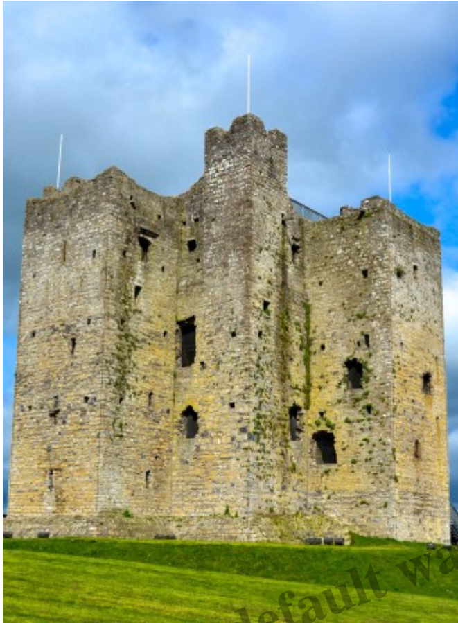
Trim Castle Ireland

We call ourselves Castle Hunters. How did we get that title? Where did our passion for Castles begin? It all started in Ireland at the magnificent Trim Castle. Constructed in the 12 th century, it is the largest Anglo-Norman fortification in Ireland. It won us over from the first look and started a path we never imagined taking.