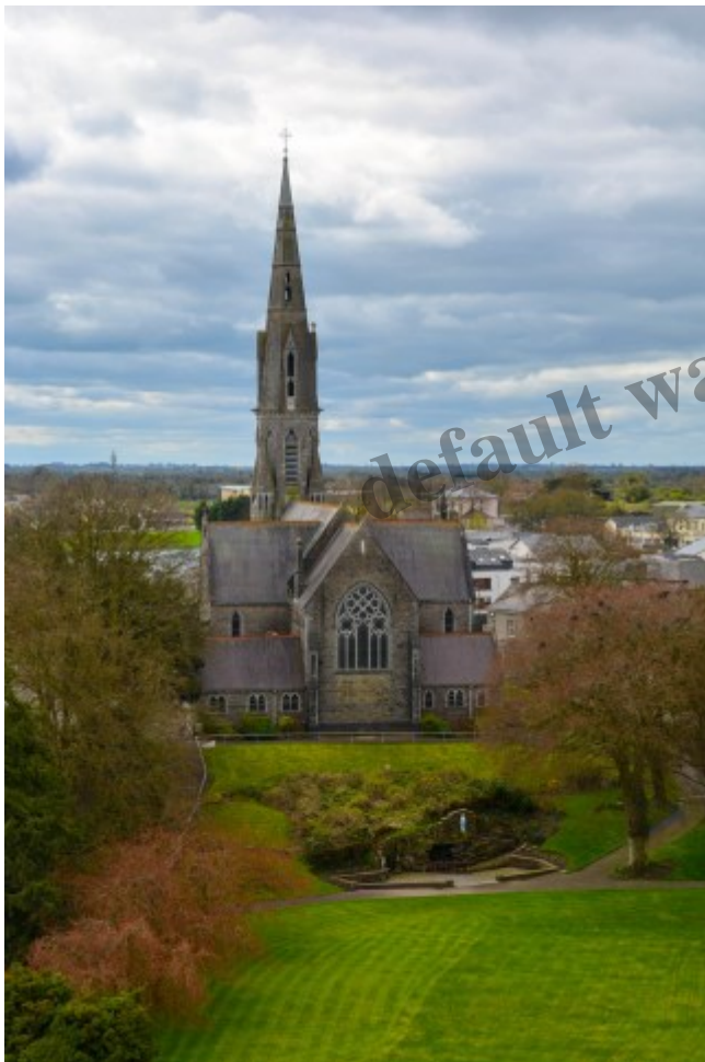
St. Patrick's Cathedral, Trim, Ireland

Before leaving town, check out the many churches and the beautiful St Patrick's Cathedral. The Cathedral was rebuilt many times since the first church in 433. The tower on the west side dates back to mid 14 th century, and the rest of the building was built in 1803. In 1955 it was designated as a Cathedral. It has a beautiful interior with dramatic stained glass in the west window.