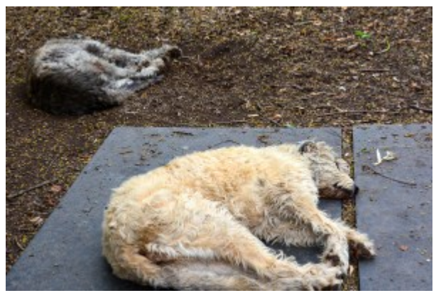
Snooxing wolfhounds they are huge!

Irish Wolfhounds have inhabited Ireland long before the arrival of Christianity and the written word. They are known for being gentle, friendly, and very intelligent. Their two resident Irish Wolfhounds, Meabh and Saoirse, are proof of this, and all who visit love them!