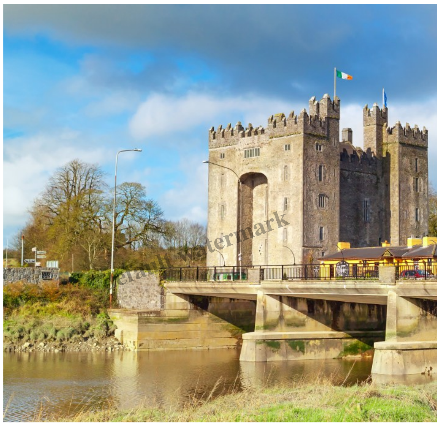
Bunratty Castle in Co. Clare, Ireland

The 15th-Century Bunratty Castle sits on a Viking trading camp from 970. Bunratty is the last of four castles built on the site. Tour this iconic fortress with your ears, eyes, and imagination while enjoying the beautiful Clare countryside. Walking to the Castle will pull you into another world and time. After you enter, you will find a gorgeously restored castle with nothing spared. Authentic whitewash brightens the stone walls, making all the art and tapestries.