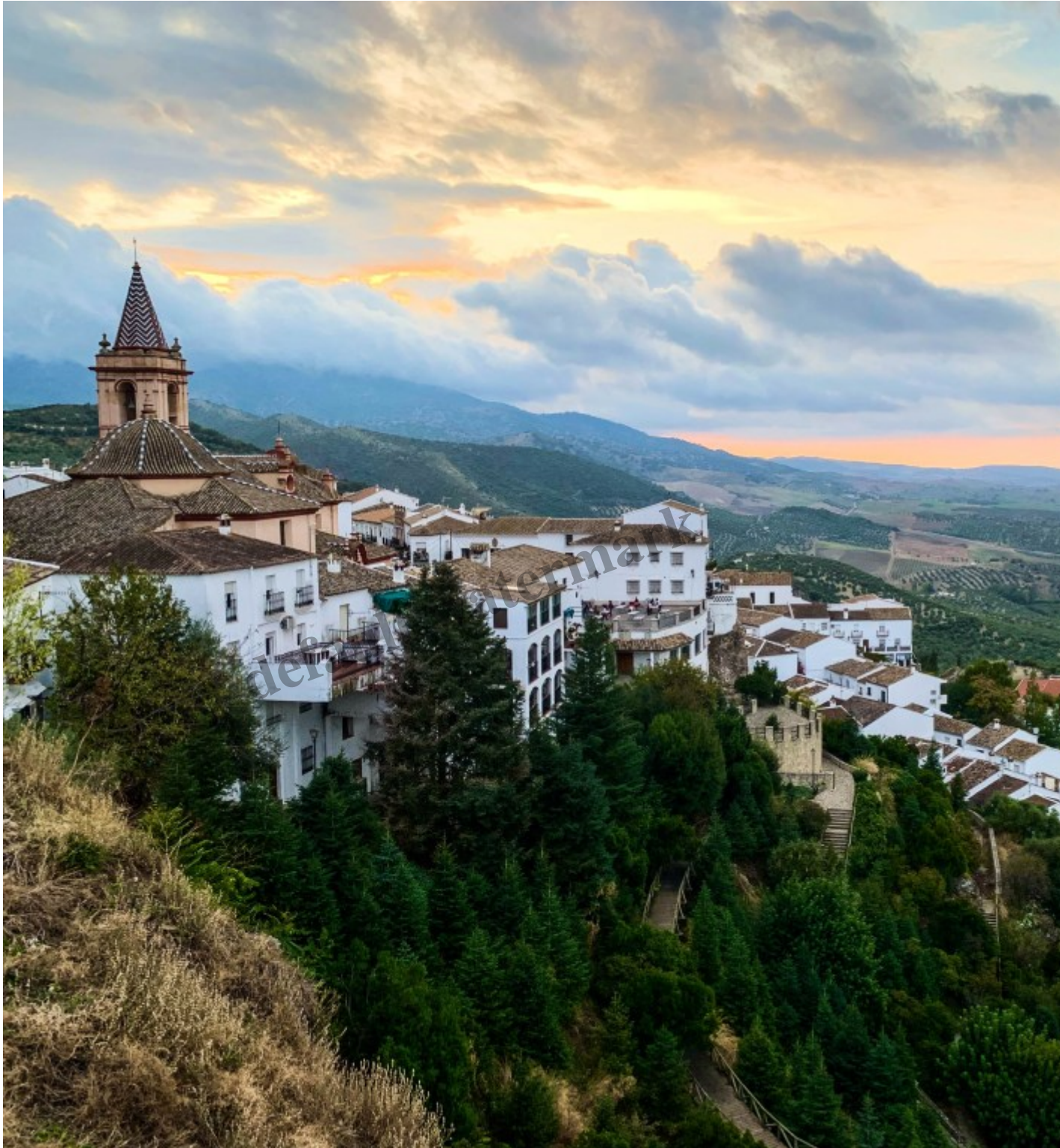
Zahara de la Sierra

While in this area of Andalucia, we suggest visiting two other white towns on the same day trip to Ronda.