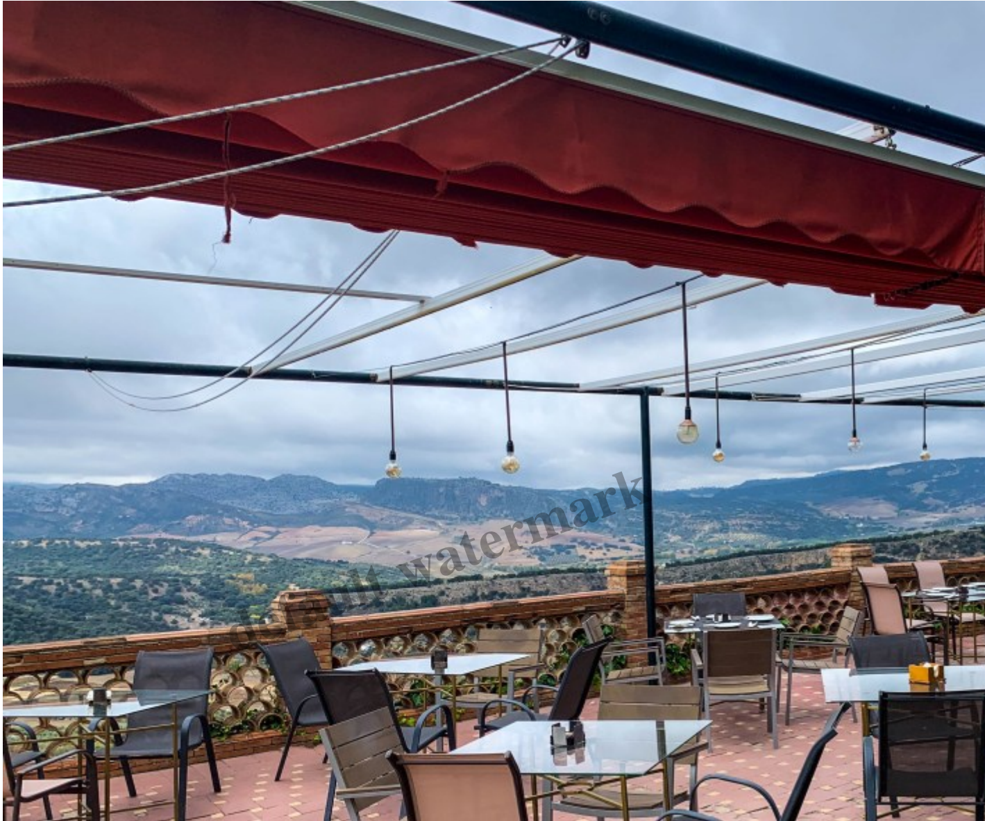
The El Morabito Terrace Ronda

There are many great places In Ronda to stop for local treats and possibly a meal; there are plenty of bakeries and shops with local delights. We grabbed a delicious pastry to give us a bit of sustenance for our final climb. In the mood for an authentic Spanish treat? Find a cafe serving churros and hot chocolate.