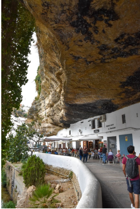
Setenil de las Bodegas

Setenil de la Bodegas ( click here for the article ) and Zahara de la Sierra are entirely different from Ronda but astounding in their unique ways. They are all relatively close, and the drive is delightful. It would take an hour to drive a loop to all three towns.