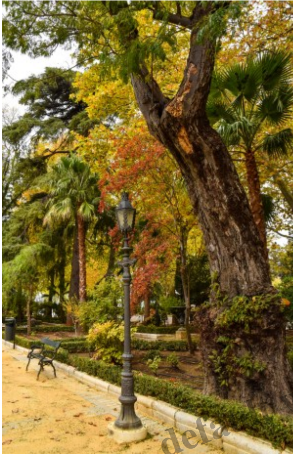
Alameda del Tajo

Finally, you cross the Puente Nuevo bridge into the northern New Town area. There you will find picturesque views of the river valley below and the town surrounding the edges of the cliffs. Once across, you will discover Mirador de Ronda, a great lookout point of the gorge. A short distance away is the beautiful Plaza de Espana. The Plaza is near the Bullring of Ronda.