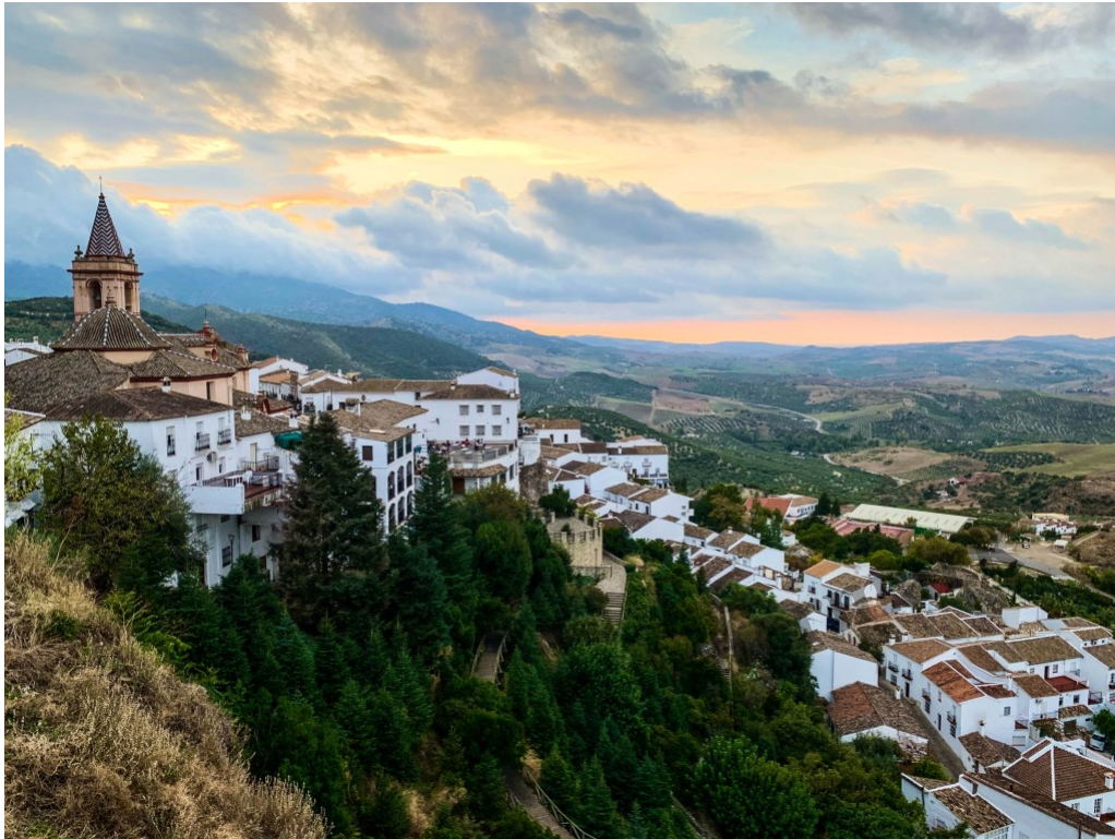
Zahara de la Sierra

It is a small, incredible hilltop white town with a heartwarming sense of community. The valley around Zahara de la Sierra is breathtaking, and the views alone are worth the trip up to narrow roads to reach the town. A Castle is perched above the village as if watching over its residents. You can choose from many restaurants and bars in town. Walking the city is challenging due to the steep streets, but take your time and take it all in. Our visit there came on Halloween, the day before All Saints Day. The town residents were in the process of decorating the graves of their loved ones in the most elegant and elaborate floral displays. Observing this annual ritual that honored those who passed before them felt personal and meaningful. The cemetery was lovely and had the best views the town offered.