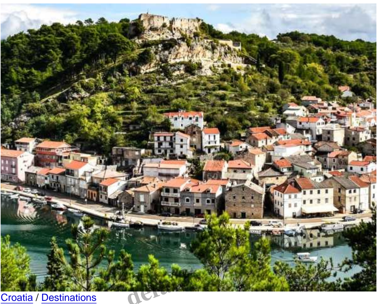
Croatia / Destinations