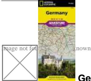
Germany National Geographic Map 3312

This is a great map. It's easy to read with practical road and travel information. Castles were marked as well as all major destinations. Though we default to Google Maps, this came in handy when service was poor or during construction detours. Waterproof, Tear-resistant. Find this essential map here.