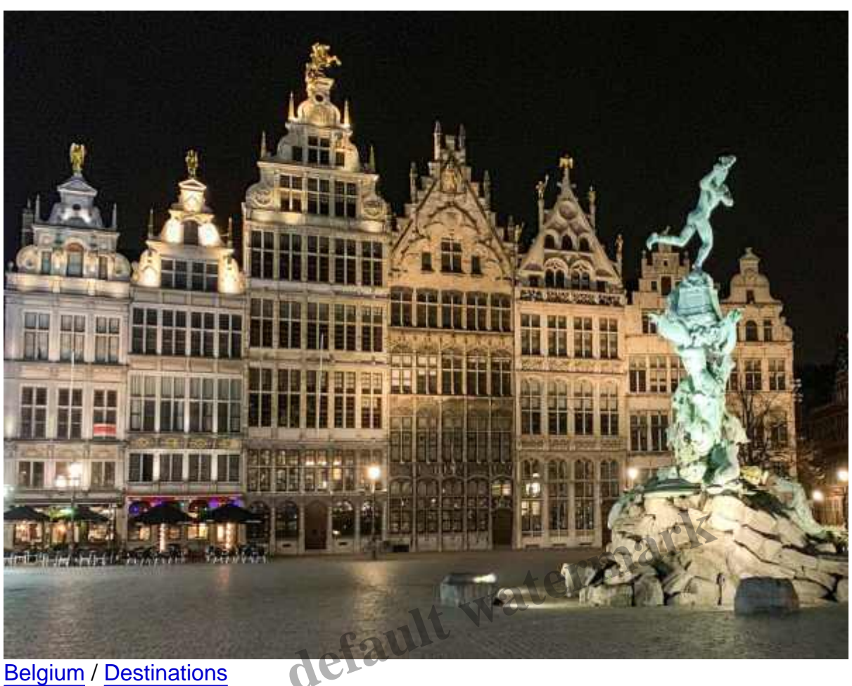
Belgium / Destinations